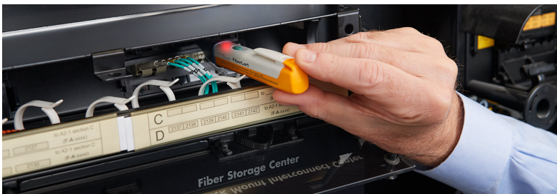
Determine if a port is live. Small size makes it easy to access cramped patch panels.