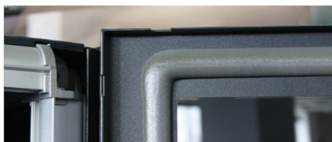
Polyurethane gasketing for IP protection